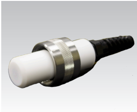
Germicidal Sensor PW254

The GLM100 Germicidal Lamp Monitor can interface with a variety of Solar Light's germicidal sensors. GLM100 is compatible with the PW254, PWA254 and UW254.