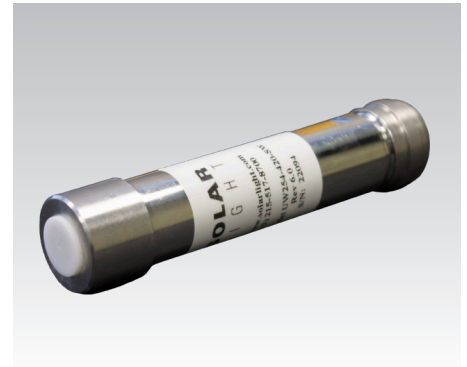
Germicidal Sensor UW254