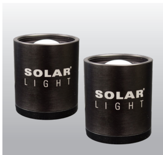
Included NIST-Traceable SUV & UVA Sensors