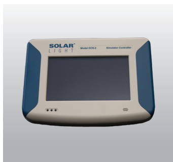
Included DCS-2 Automatic Dose Controller