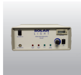
Included XPS-300 Xenon Lamp Power Supply